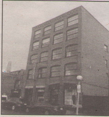
44-46 Plympton and 61-63 Wareham Streets - Boston, MA

The building is primarily brick and beam, built in the 1870s, and